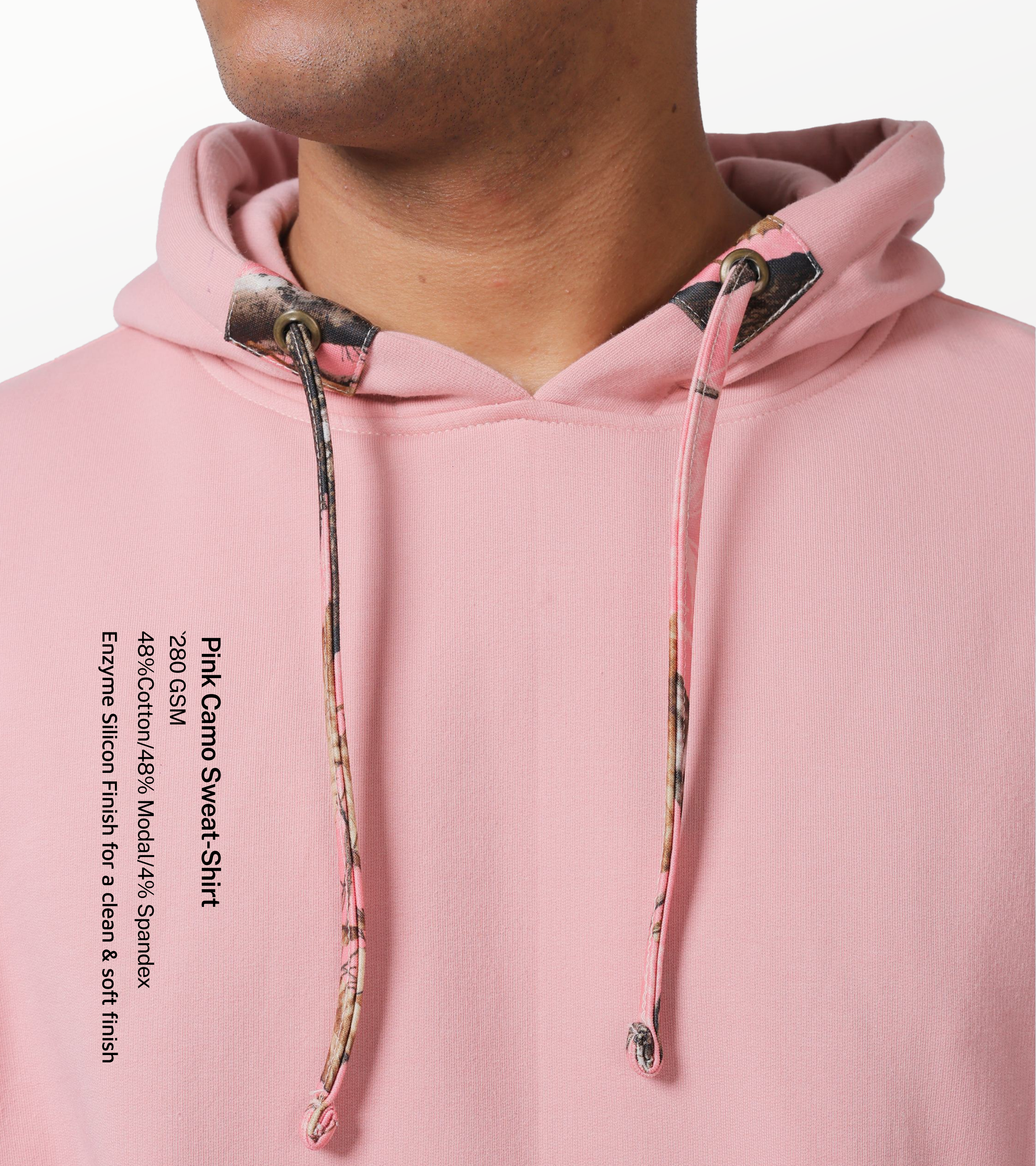
Pink Camo Sweat-Shirt 280 GSM 48%Cotton/48% Modal/4% Spandex Enzyme Silicon Finish for a clean & soft finish