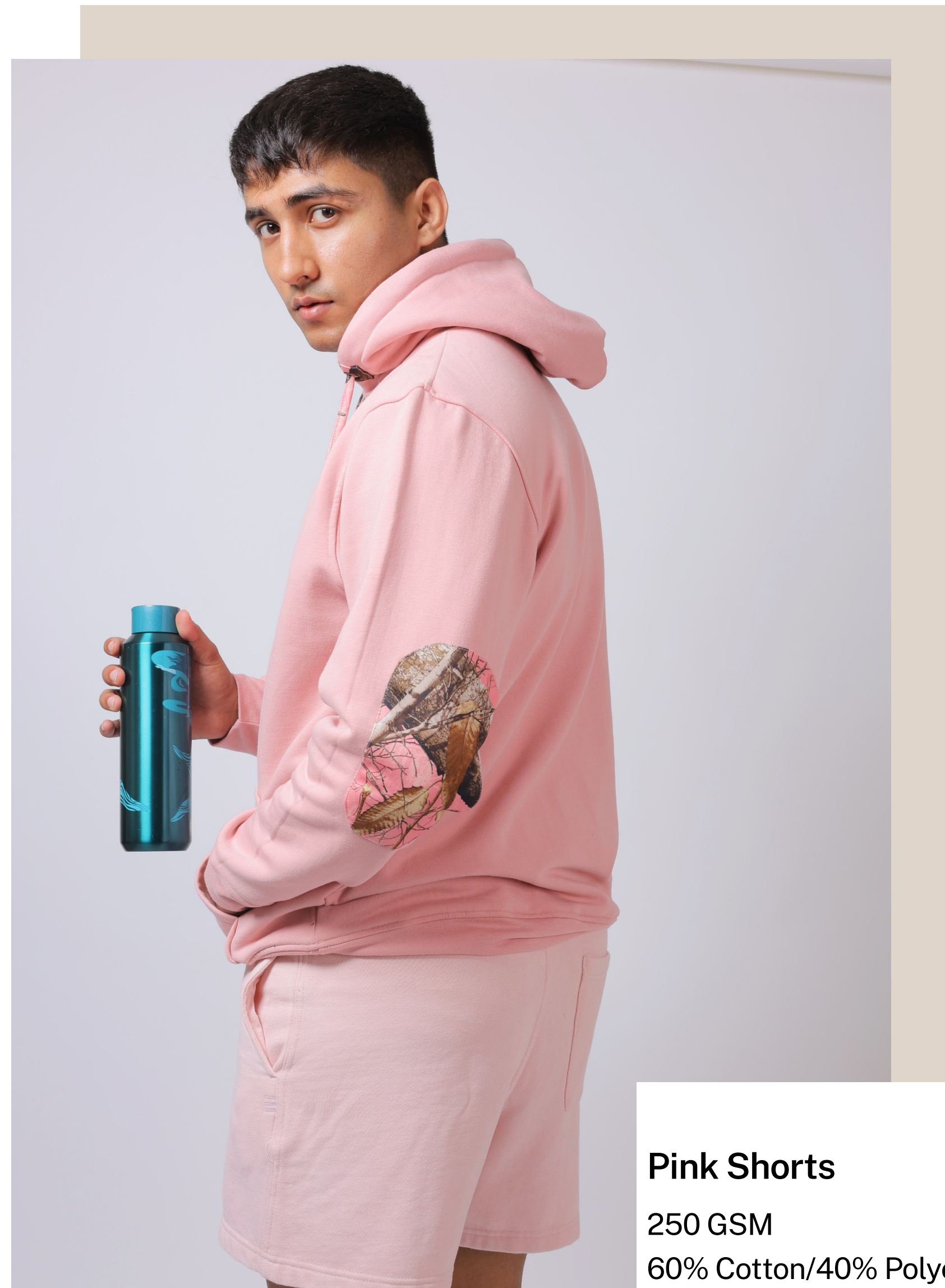
Pink Shorts 250 GSM 60% Cotton/40% Polyester